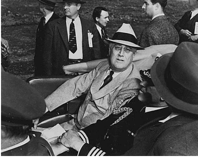
FDR Rides in Washington, D.C.