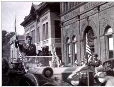
Wilkie Campaign Parade