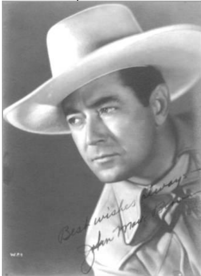
Cowboy, Johnny Mack Brown, at the movies.